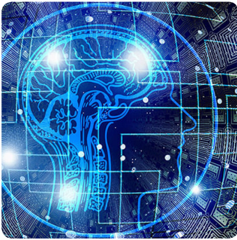
Exclusive FuzzyScan Imaging Technology